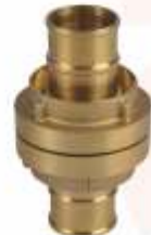
Storz Type Coupling