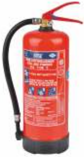
Dry Powder Fire Extinguisher