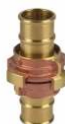
Russian Type Coupling