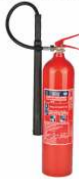
CO2 Fire Extinguisher