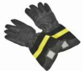
Gloves for Fireman Suit