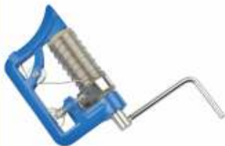
Hose Binding Apparatus