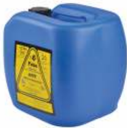
Foam Concentrate Protein AFFF