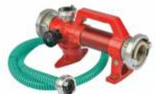
Compounder W/Suction Hose