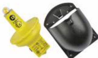
ExProof Daniament Lifebuoy Light