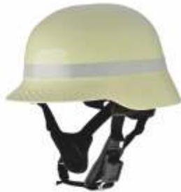
Helmet for Fireman Suit