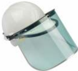
Prot. Helmet W/Visor