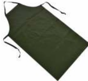
Acid Protective Apron