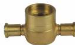
UK Type Adaptor