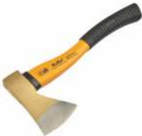
Axe for Fireman Suit