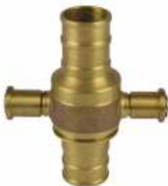
UK Type Coupling