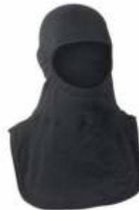
Hood for Fireman Suit