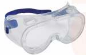
Chemical Protective Goggles