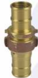
US Type Coupling