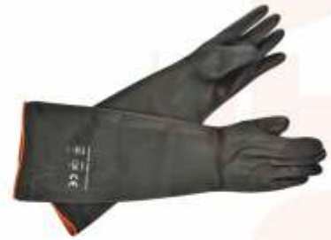
Acid Protective Gloves