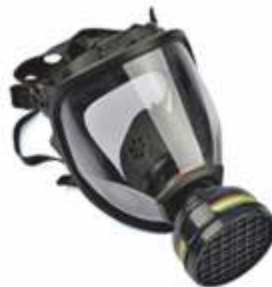
Full Face Mask W/Filter