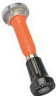
Branchpipe AWG HS