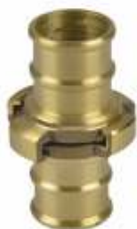
Italy Type Coupling