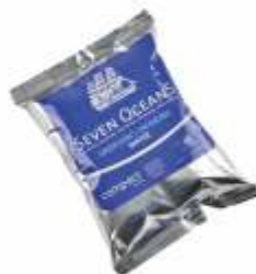
Emergency Drinking Water