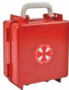
First Aid Kit (Boxed)