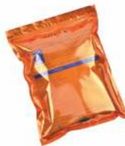
First Aid Kit (Bag)