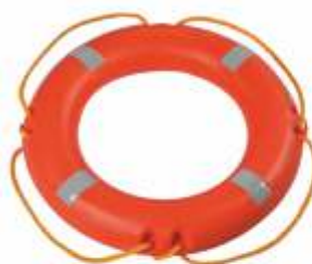
Lifebuoy 4 KGs