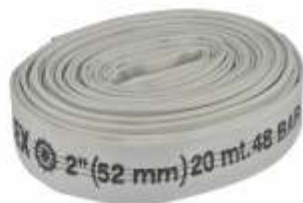
Fire Hose - White