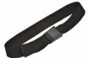
Strap for Fire Extinguisher