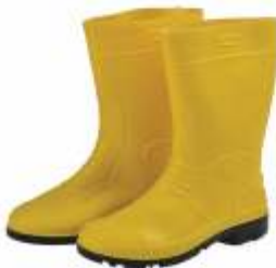
Acid Protective Boots