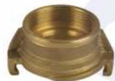
Nakajima Type Adaptor