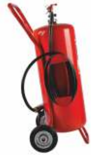
Wheeled DP Fire Extinguisher