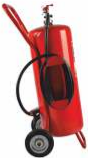
Wheeled Foam Fire Extinguisher