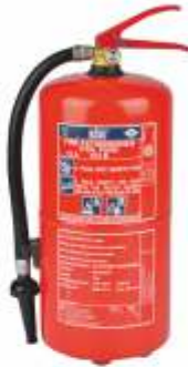
Foam Fire Extinguisher