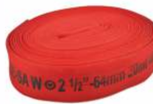
Fire Hose - Red