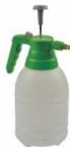
Jet Spray for Dispersant