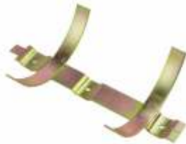
Bracket for Fire Extinguisher-1