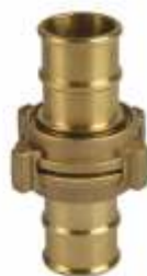
Nakajima Type Coupling