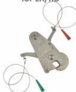
Autotmatic Release Hook for LR/RB