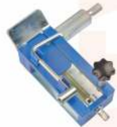
Hose Binding Apparatus Fixture