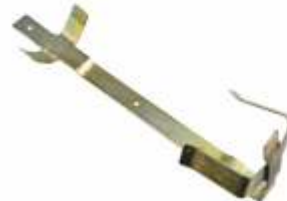
Bracket for Fire Extinguisher-2