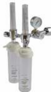
MEDO2 Regulator (Double)