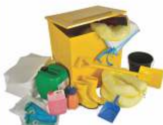
Oil Spill Kit