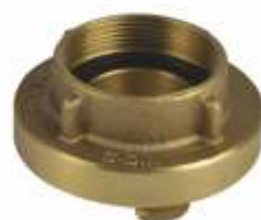
Storz Type Adaptor