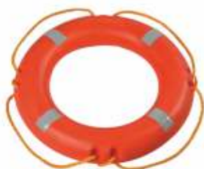
Lifebuoy 2,5 KGs