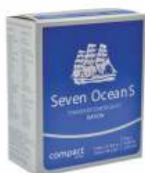
Emergecny Food Ration