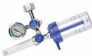
MEDO2 Regulator (Single)